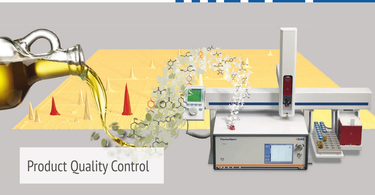
Product Quality Control