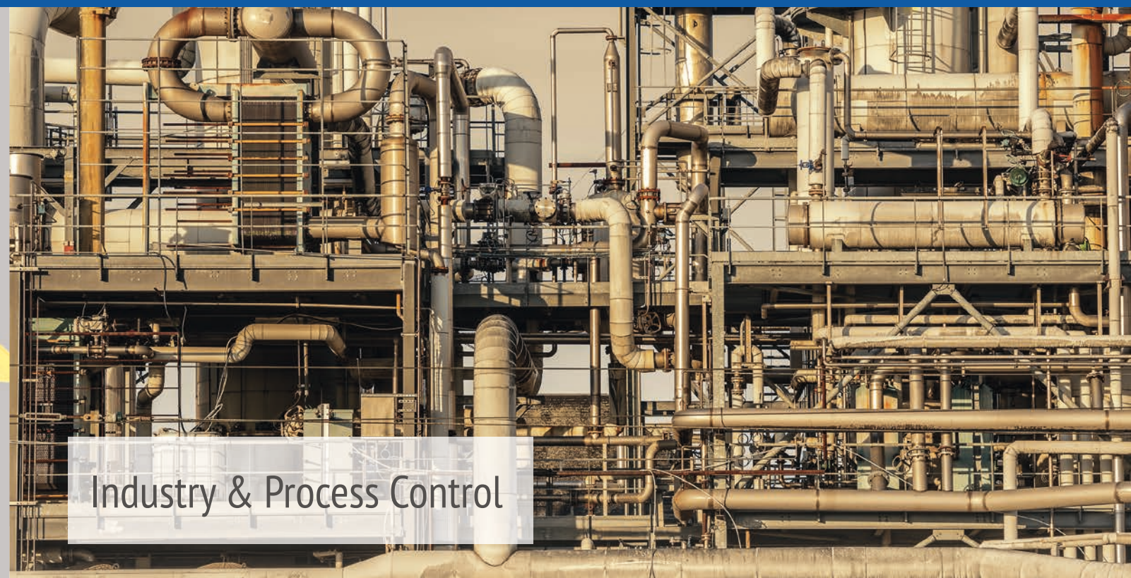
Industry & Process Control

Product identification and authentication same as quality control in general plays a major role in the food and flavour industry.