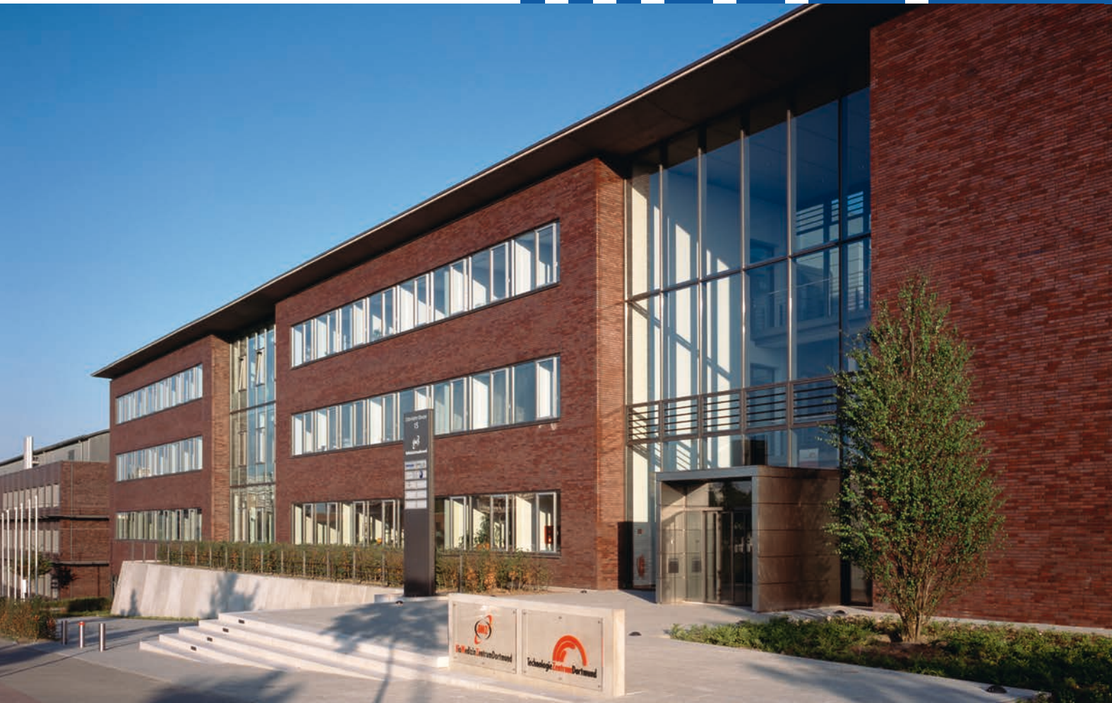
G.A.S. facility at TechnologyCenterDortmund, Germany