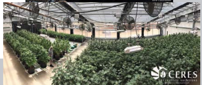
Propagation, Cloning, Veg, Drying, Stages with A.I. Monitoring & Controlling Systems