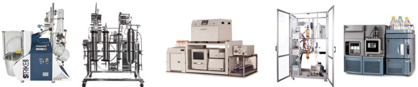
Rotary Evaporation - CO2 Extraction - Supercritical Fluid Chromatography - Short Path Distillation - UPLC